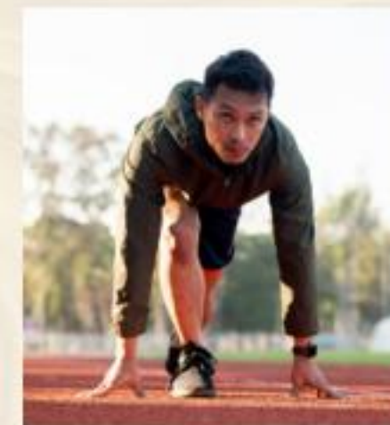
Running & Cycling Tracks